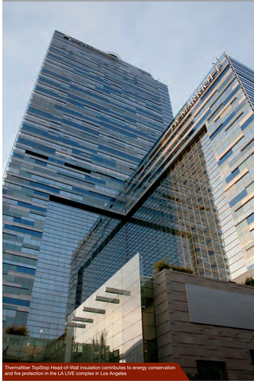
Thermafiber TopStop Head-of-Wall insulation contributes to energy conservation and fire protection in the LA LIVE complex in Los Angeles