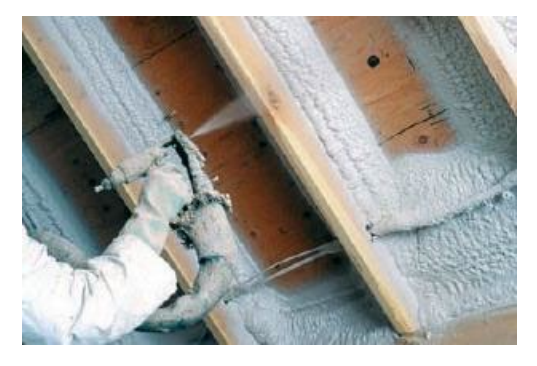
Photo of SPF being applied to wood deck using picture framing technique. Spraying foam onto a metal panel surface would be done in the same fashion.

follow manufacturers' installation instructions on pass thickness limits and proper cooling times between subsequent passes made to develop the desired total thickness of the insulation.